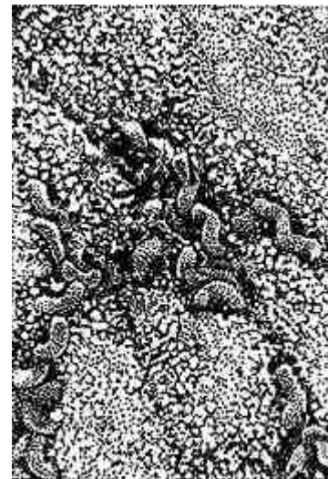
H. pylori bacteria

Urea breath tests are an effective diagnostic method for H. pylori . They are also used after treatment to see whether it worked. In the doctor's office, the patient drinks a urea solution that contains a special carbon atom. If H. pylori is present, it breaks down the urea, releasing the carbon. The blood carries the carbon to the lungs, where the patient exhales it. The breath test is 96 percent to 98 percent accurate.